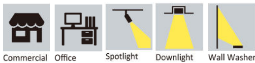
Commercial Office Spotlight Downlight Wall Washer